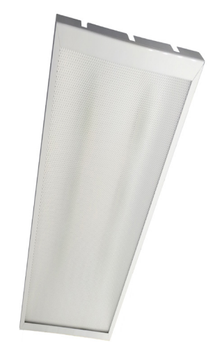
OL14 1x4 Troffer

Applications include: Office, Retail, Gymnasium, and Warehouse Spaces.